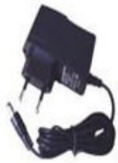
EU Power Supplier