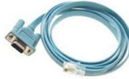
RJ45 to DB9 Cable