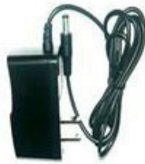
US Power Supplier