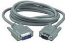
DB15 to DB9 Cable