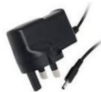
UK Power Supplier