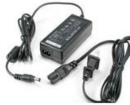
Desktop Power Supplier EU, US, AU, UK for choice