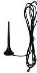
Rubber Magnetic-Mount W/ Cable