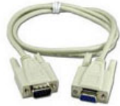
DB9 serial cable