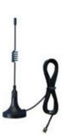
Metal Magnetic-Mount W/ Cable