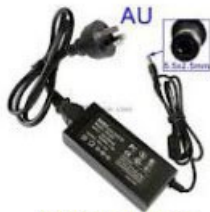
AU Power Supplier